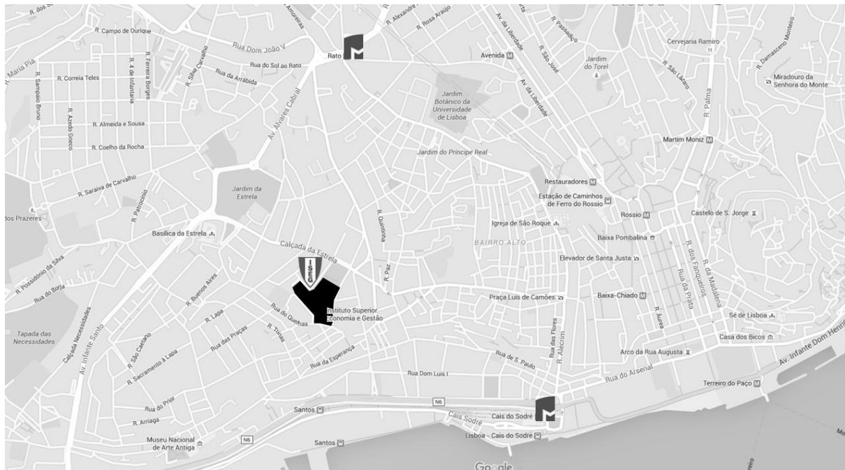
Fig. 1 above shows you the location of ISEG campus in the centre of Lisbon. The nearest underground stations are Rato (at a 20-minute down-the-hill walking distance) and Cais do Sodré (same distance, flatter).