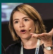
Catarina Albuquerque UN' Sanitation and Water for All