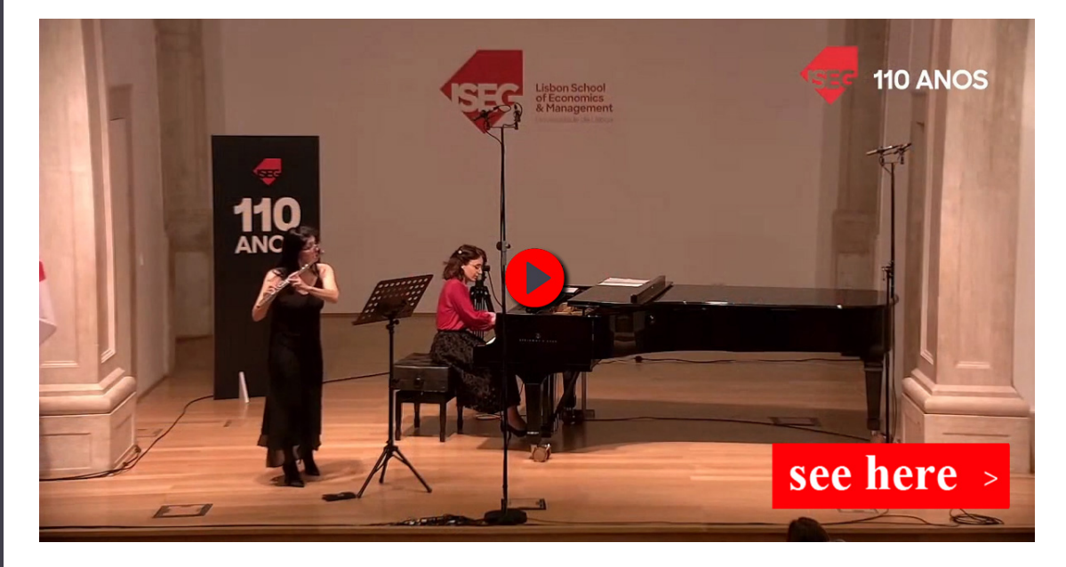
Dia 23 de maio

Dia 20 de maio Concert of "100 years of Astor Piazzolla"