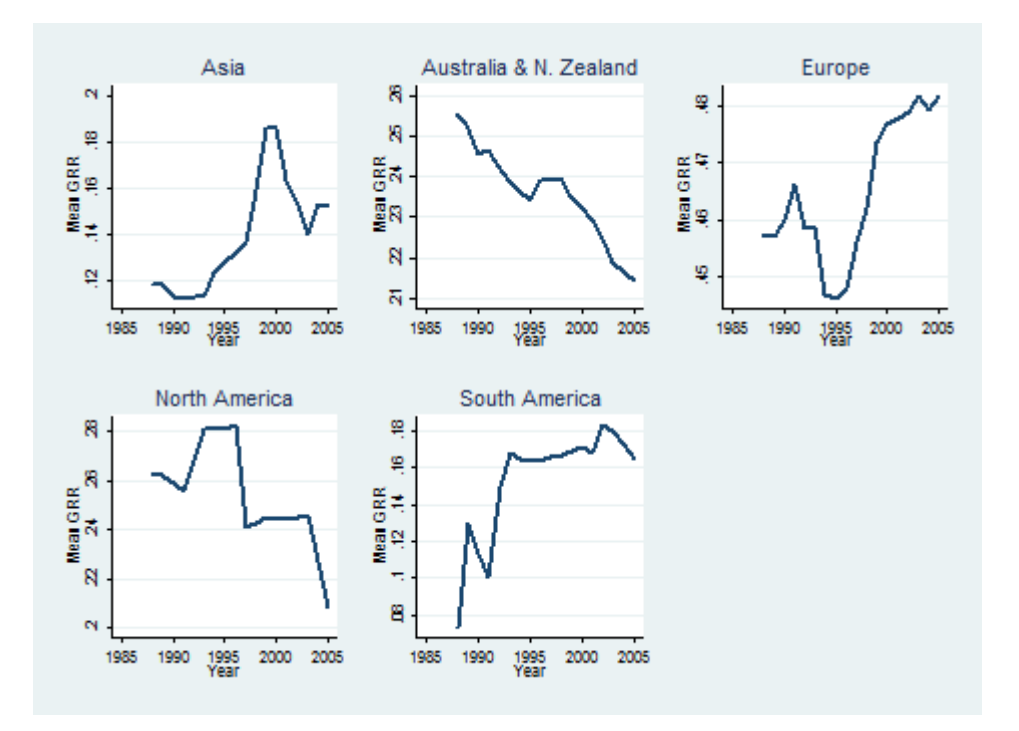
Figure 1. Time Series of Gross Replacement Rates: Averages by Continents

The figure shows the time series of average gross replacement rates in the countries included in our sample, grouped by continents, over the period 1988-2005. Gross replacement rates are calculated as the ratio of the unemployment insurance benefits received by a worker in the first year of unemployment relative to the worker's last gross earning.