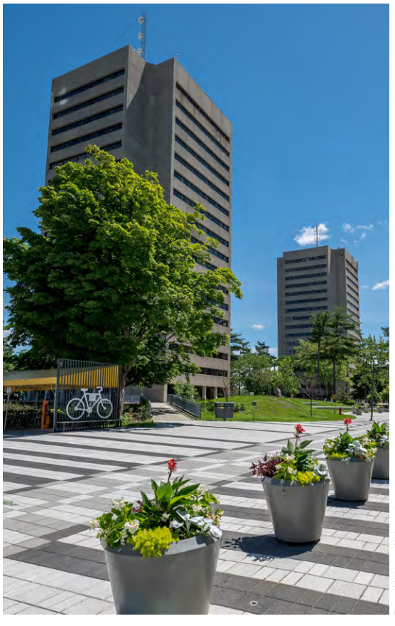
any Vachon / ULaval