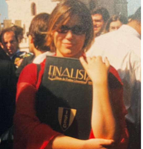
Left, nowadays. Right, in 2002 as a graduate of Management at ISEG.